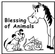
Blessing of Animals