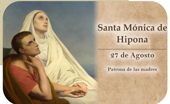
Santa Mónica de Hipona

Criar hijos fieles no es una tarea fácil. Para Santa Mónica, parecía casi imposible. Su marido no era cristiano y a menudo se burlaba de su fe. Su hijo, Agustín, rápidamente cayó en caminos salvajes. Él y sus amigos bebían, robaban y se divertían por toda la ciudad. Mónica nunca dejó de orar por Agustín, por mucho que se desviara. Agustín se vio arrastrado por la herejía, una forma falsa de cristianismo. Vivía con una amante y tuvo un hijo fuera del matrimonio. Mientras tanto, Mónica siguió orando. La conversión de Agustín llegó lentamente, pero a los 32 años finalmente fue bautizado. Agustín se convertiría en sacerdote, luego obispo y luego en un teólogo de renombre mundial cuyas obras han resistido la prueba del tiempo. Que Santa Mónica y San Agustín nos inspiren a nunca dejar de orar por nuestros seres queridos.